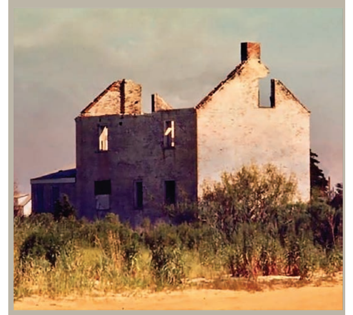
East Point Light in the early 1970s, after a fire took most of the structure.

The Maurice River Historical Society, which cares for the East Point Lighthouse in New Jersey has lost its lease. The group, which was formed in the 1971, has restored the historic lighthouse from a mere shell of a structure to a working lighthouse. After over 5 decades of work, they have now been denied access to the lighthouse. Once restored, the lighthouse has become a living history museum with many events throughout the year. We can only hope that they are going to be able to resolve this situation quickly.