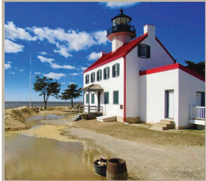
After a storm in 2018.